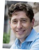
Jacob Frey Mayor City of Minneapolis