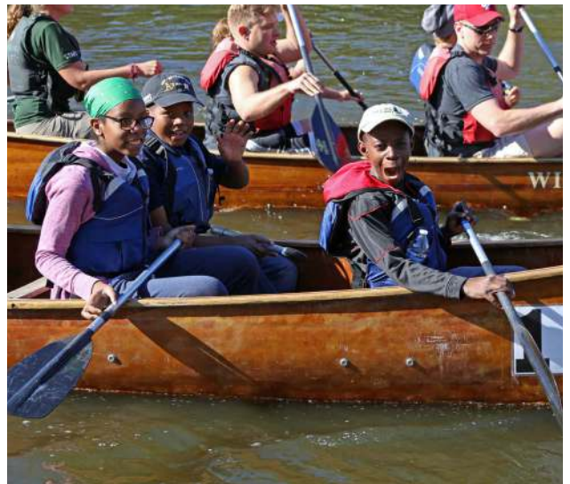
Students paddle as a team and conquer fears