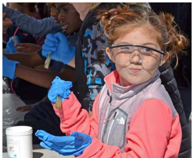
Students learn science by testing water quality

Neil DuBois Memorial Fund Orange Tree Pearson's Salted Nut Roll Peregrine Peterssen / Keller Architecture Polaris Industries RBC Capital Markets Riley Hayes Advertising Ryan Companies Target TASC TCF Bank Thomson Reuters Travelers UCare University of Minnesota Venture Bank Walser Wells Fargo