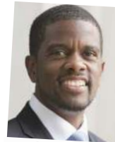
Melvin Carter Mayor City of Saint Paul