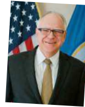
Tim Walz Governor State of Minnesota

Please join us in supporting Canoemobile by getting involved in the Great River Race today.