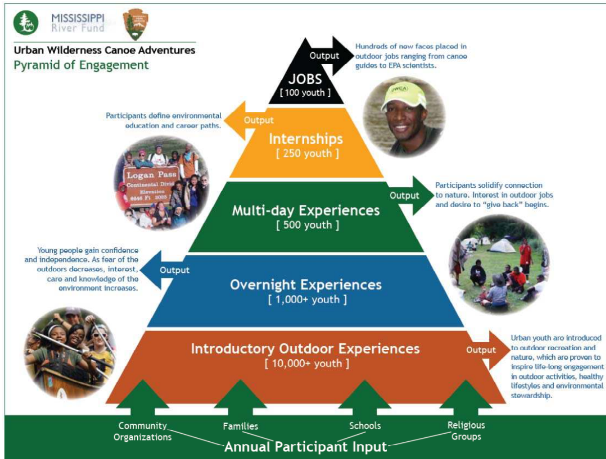
FIGURE 1. PYRAMID OF ENGAGEMENT

Midterm goals of UWCA are that youth will experience a deepening interest in the natural environment through continued exposure to natural setting. It is also hoped that students will experience an improvement in academic outcomes through an innovative classroom/fieldwork curriculum that uses environmental educational experiences to teach science, social studies, and language arts. It is believed that through a series of engaging outdoor education experiences, students will make their own personal discoveries that will energize their interest in learning. Teamwork, which is an essential and prominent element of UWCA activities, will also develop valuable interpersonal skills. Students working in teams quickly learn to value their own contributions and the contributions of others. Trips are also a valuable